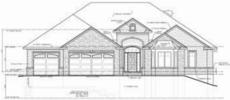
FRONT ELEVATION 8/24/2024